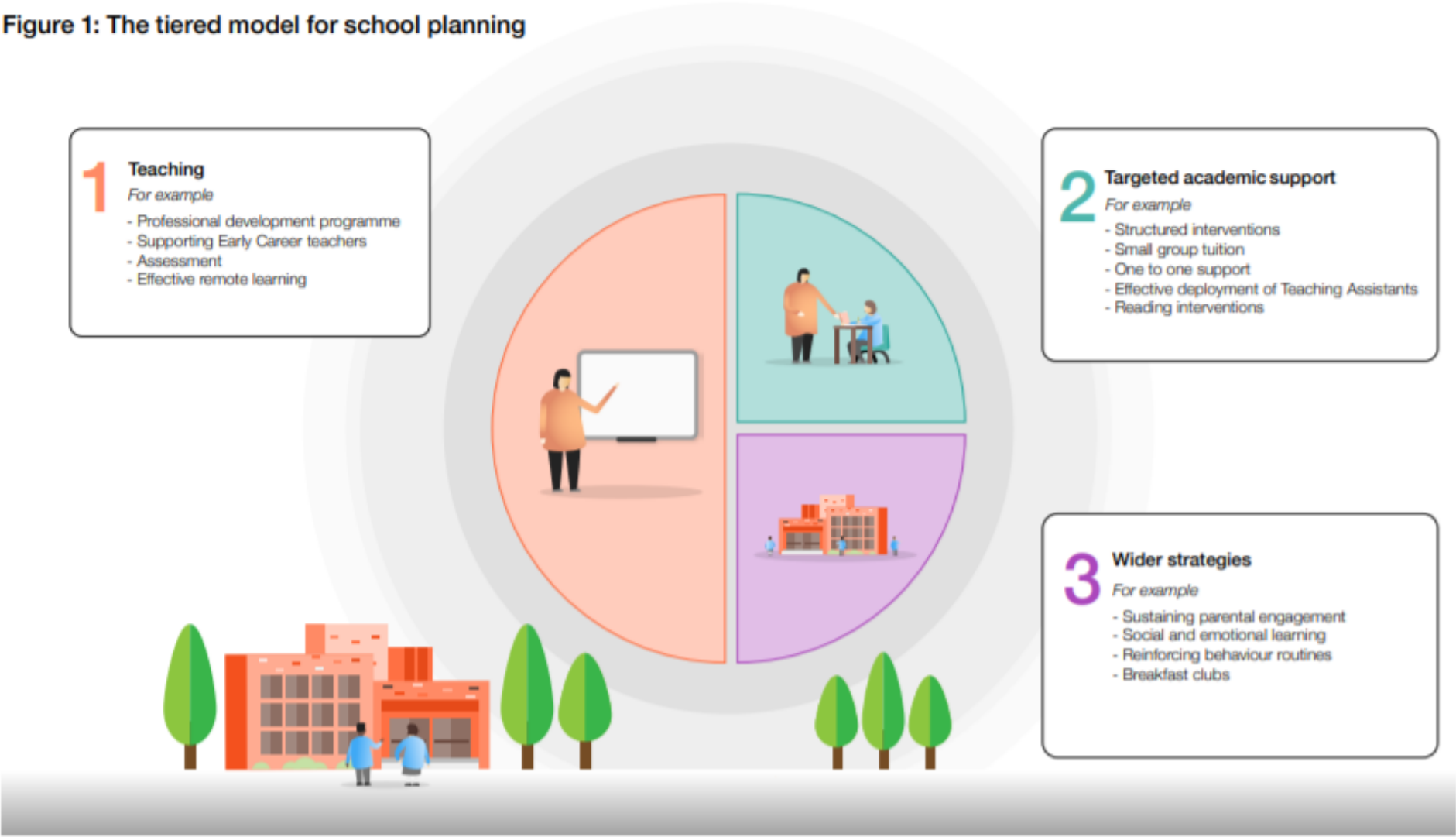
Figure 1: The tiered model for school planning